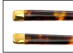
Gold (PVD color)