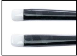
White (material color)