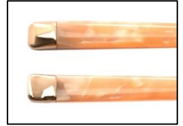
Pink gold (PVD color)