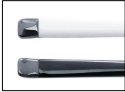
Dark gunmetal (material color)