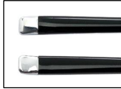
Silver (PVD color)